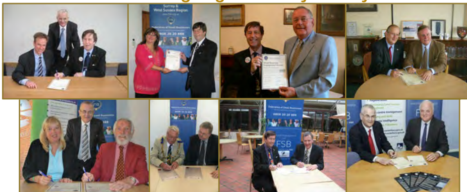
Top row L-R West Sussex County Council, Crawley Borough Council, Mid Sussex District Council & West Berkshire Council, Bottom row L-R Chichester District Council, Maidstone Borough Council, Surrey County Council & Canterbury City Council