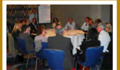
Sustainable procurement workshop delegates