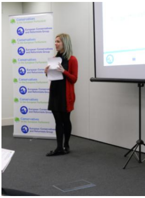
FSB member and founder of Workingmums.co.uk speaking on female entrepreneurship