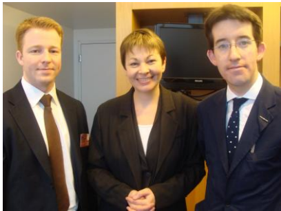
FSB and ESBA discussing accountancy rules for micro enterprises with Green Party MEP Dr. Caroline Lucas