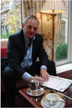
UKIP MEP The Earl of Dartmouth becomes the latest politician to sign the FSB's "Stop the Blockades" petition