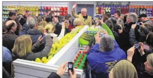
Centre of attention: Chris Evans opens the store