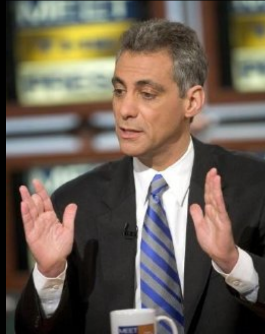
Rahm Emanuel President Obama's Chief Of Staff

“You never want a good crisis to go to waste”