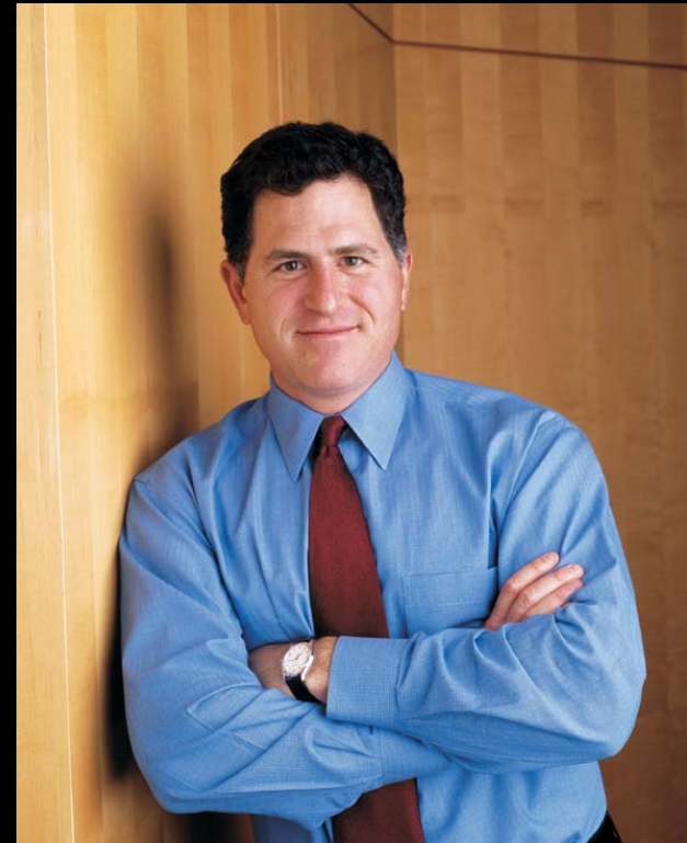
Michael Dell Founder and CEO

“The times when everyone is confused and stunned can present an enormous opportunity, because no one’s really doing anything.”