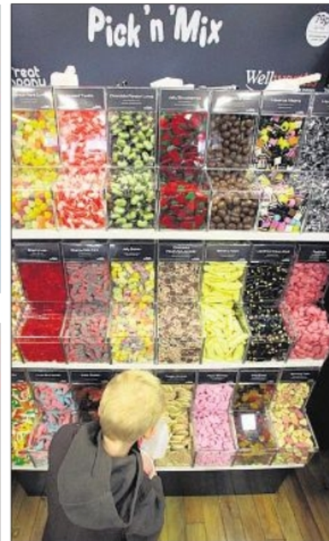
Crowd pleaser: The pick 'n' mix display