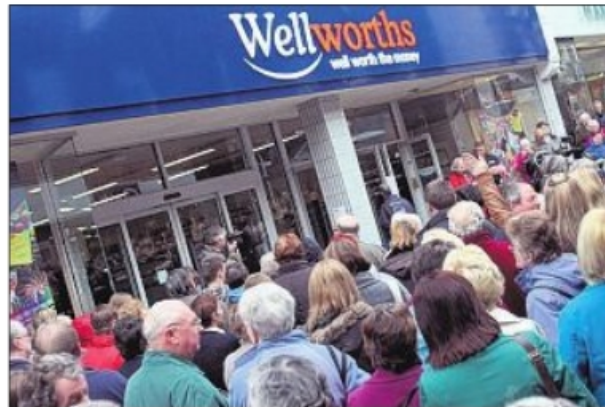
Eager: Shoppers wait for Wellworths' doors to open