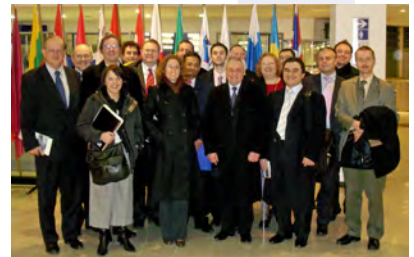
Thames Valley delegates in the EU Parliament