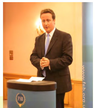
David Cameron addressing Thames Valley FSB members

Thames Valley's Leading Business Organisation