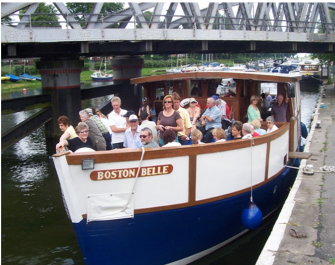
Members of the FSB Wash Branch joining the Boston Belle at the Sluice Bridge at Boston.

Saturday 16th June 2012, departing 2.15pm Sailing from the Sluice Bridge at Boston